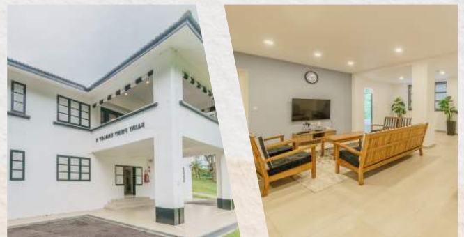
Fairy Point Chalet 4 (6 bedrooms, 579sqm)