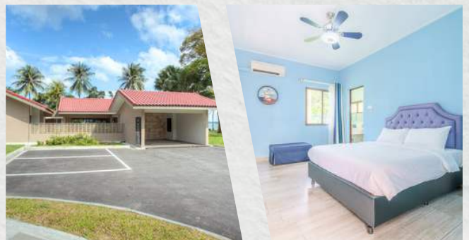
Sea View Bungalows (4 bedrooms, 286sqm)