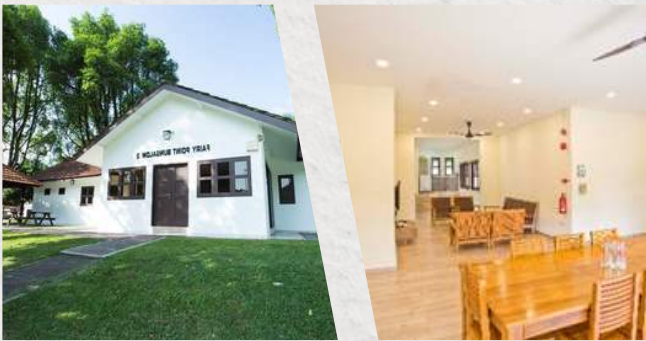
Fairy Point Bungalows (4 bedrooms, 207sqm)