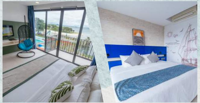
Deluxe Suite (1 bedroom, 43sqm)