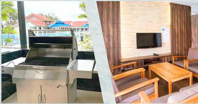
Pool Terraces (4 bedrooms, 360sqm)