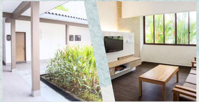
Garden Terraces (2 bedrooms, 270sqm)