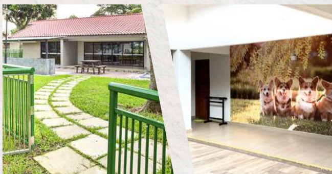
Dog-Friendly Bungalows (4 bedrooms, 286sqm)