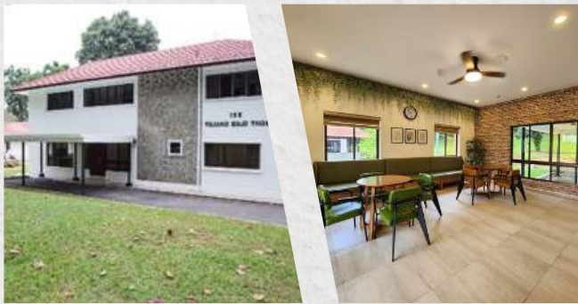
Yacht Club Chalet (5 bedrooms, 322sqm)