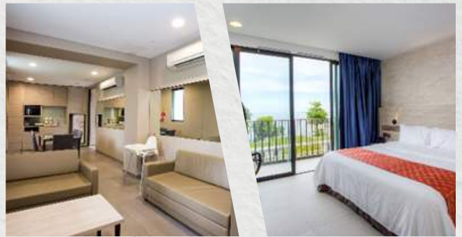
Family Suite Plus (2 bedrooms, 86sqm)