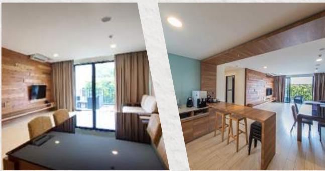
Family Suite (2 bedrooms, 86sqm)