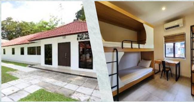
Yacht Club Bungalows (3 or 4 bedrooms, 191sqm)