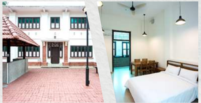
Netheravon Terraces (1 bedroom, 34sqm)