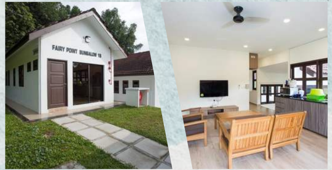
Fairy Point Bungalow (1 bedroom, 56sqm)