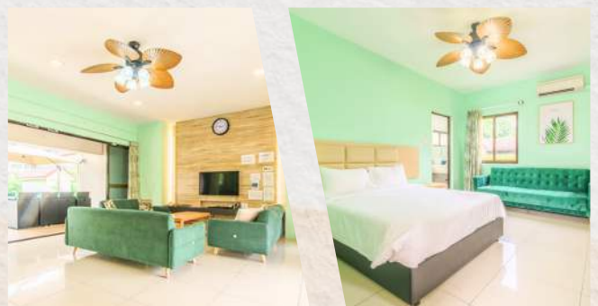
Garden Bungalows (4 bedrooms, 286sqm)