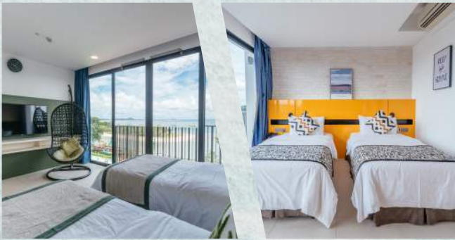
Superior Suite (1 bedroom, 43sqm)