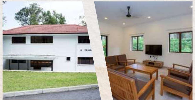
Garden Chalets (5 bedrooms, 322sqm)