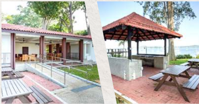
Seafront Chalets (4 bedrooms, 270sqm)