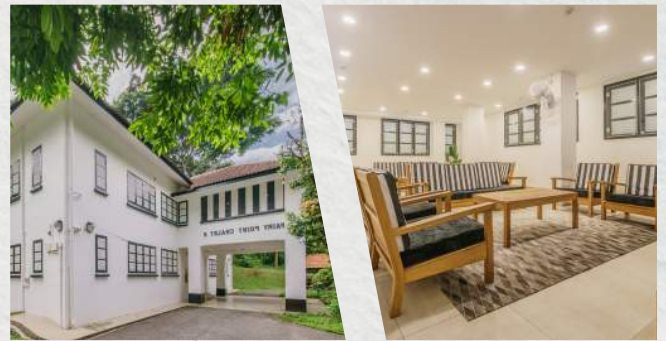
Fairy Point Chalets (4 bedrooms, 579sqm)