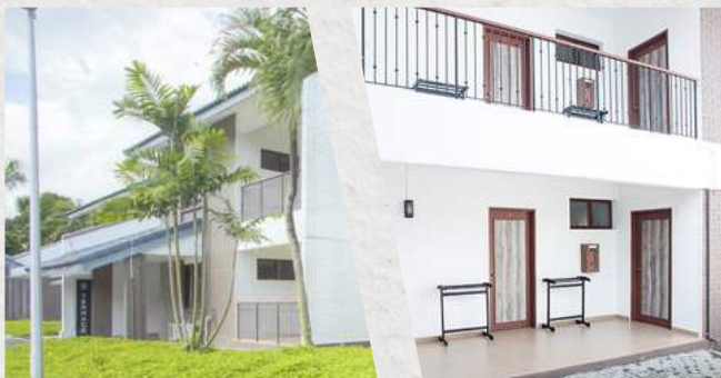
Sea View Terraces (4 bedrooms, 360sqm)