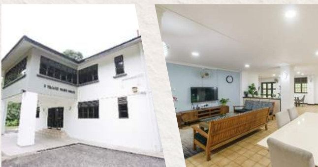
Fairy Point Chalet 6 (5 bedrooms, 633sqm)