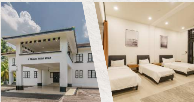
Fairy Point Chalet 3 (5 bedrooms, 579sqm)