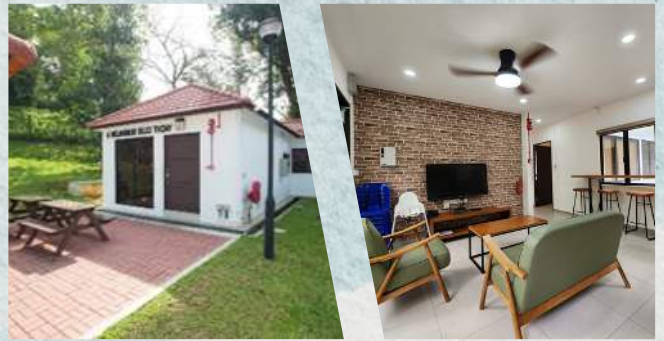
Yacht Club Bungalows (2 bedrooms, 191sqm)