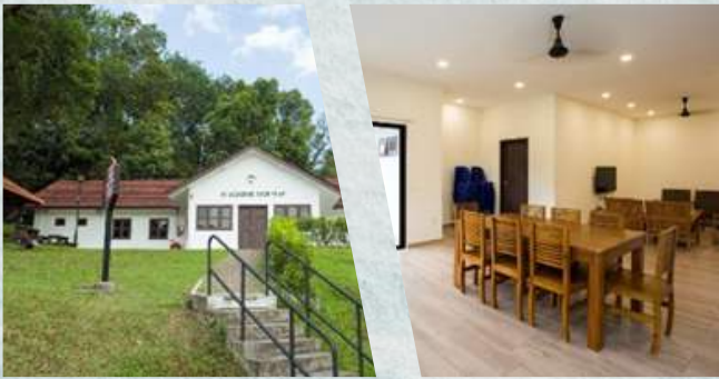
Fairy Point Bungalow (3 bedrooms, 151sqm)